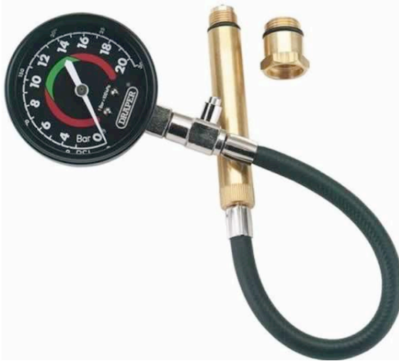
air compression tester used to test the air pressure